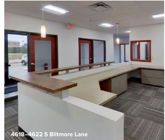
4618-4622 S Biltmore Lane