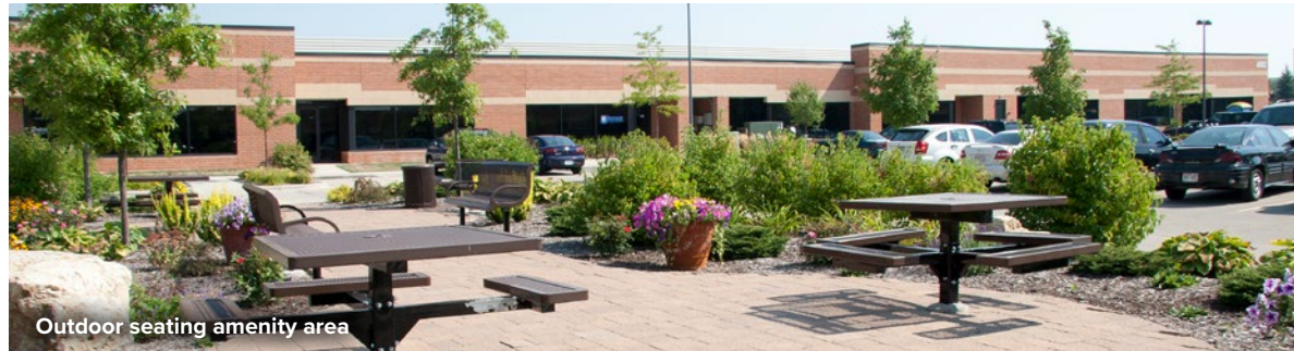
Outdoor seating amenity area