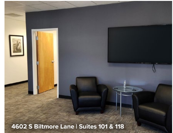
4602 S Biltmore Lane | Suites 101 & 118