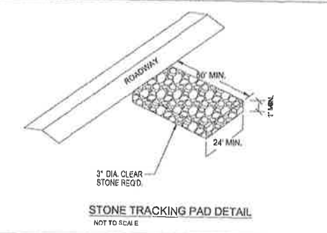
STONE TRACKING PAD DETAIL NOT TO SCALE

BIORETENTION AND INFILTRATION BASIN NOTES NOT TO SCALE NOTES: DO NOT COMPACT INFILTRATION AREA DURING CONSTRUCTION THE CONTRACTOR IS REQUIRED TO PROVIDE QUALIFIED STAFF FOR INSPECTION AND OBSERVATION OF THE CONSTRUCTION ACTIVITIES RELATING TO ALL JOB SITE REGULATION COMPLIANCE INCLUDING THE PROTECTION, RECORDS AND CONSTRUCTION OF ALL STORMWATER MANAGEMENT FEATURES SEE LANDSCAPE PLAN FOR PLANTINGS